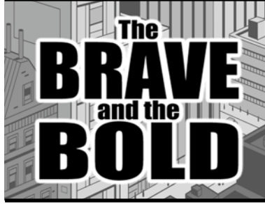
So much news to share with you today so let's get right into it!

We'll start with some housekeeping. Something funky happened with AOL since we added VBS2018 as a username last year, and now it doesn't seem to be active. So if you have news to share, use the new e-mail address listed at bottom. Thanks.